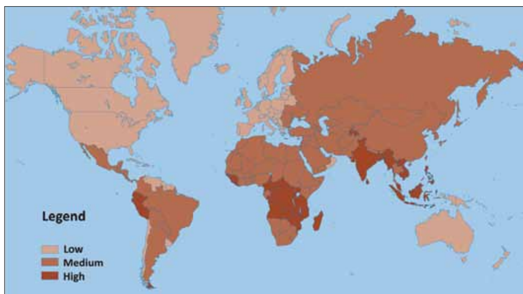
Fig. 1: Global zinc deficiency in humans [5]

Because cereals are the principal source of calories, proteins and minerals for many people in areas of the world with widespread zinc deficient soils, they are also the regions with widespread zinc deficiency in humans. In the developing world, cereals provide up to 70 % of caloric intake. For this reason, the zinc content of the major staple foods such as wheat, rice, maize and beans is of particular concern. A study in India has documented lower zinc status (in blood plasma serum) in people feeding on cereal grains with lower zinc content, coming from soils deficient in zinc [7]. Thus, there is a direct and vital linkage between the zinc deficiency in soils, crops and humans in these areas.